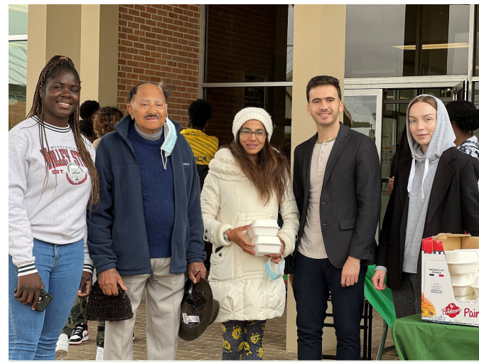
India Expat Community: MVSU International Week