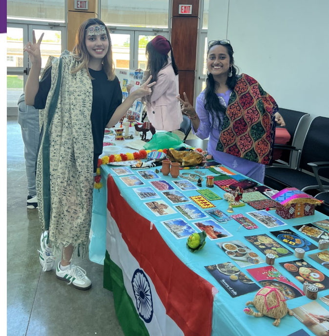
India Table at 2024 Valley Global Fest