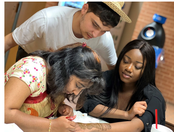
Henna Tattoos at MVSU