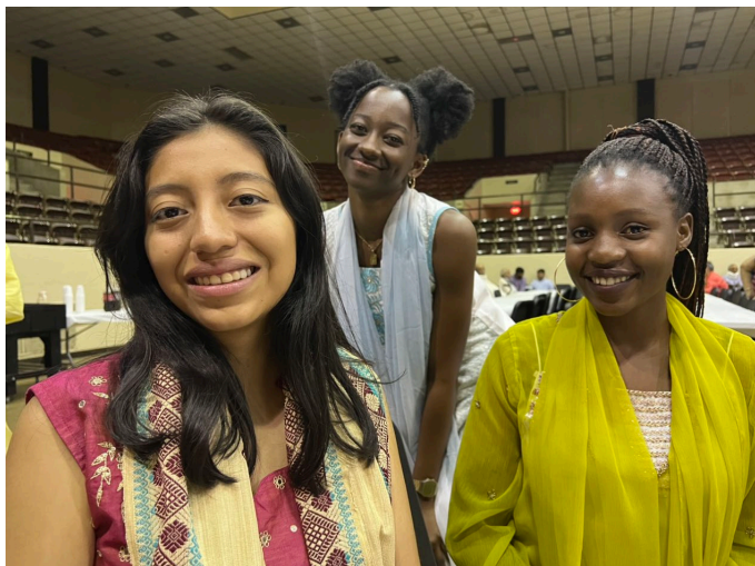
MVSU Students Participating In Diwali!