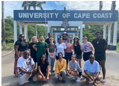
Figure 7: KSU students and faculty in Ghana.

targeted at underrepresented students to improve the visibility of study abroad on campus and promote its benefits. These materials serve as long-term resources for intentional and sustained outreach and recruitment efforts on campus. KSU collaborated with the University System of Georgia Africa Council, Savannah State University, and Albany State University (both Historically Black Colleges and Universities in the Georgia state system and recipients of their own IDEAS grants) on recruitment activities to increase effectiveness and engagement with students from a range of backgrounds. In addition, IDEAS grant funds supported faculty travel expenses for the student program to Ghana in summer 2022.