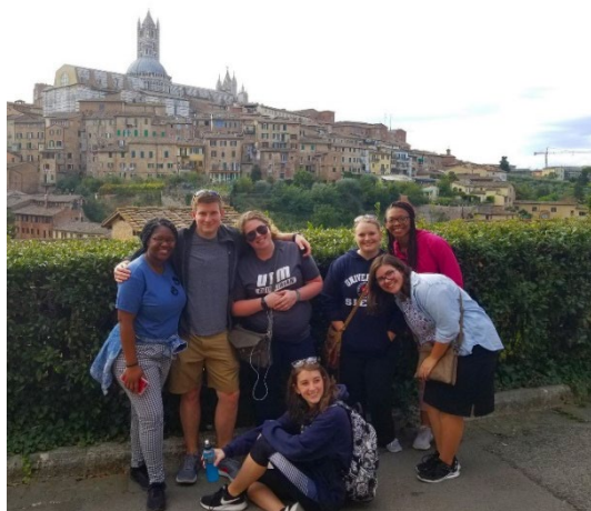
Figure 15: University of Tennessee at Martin students in Italy.

students for careers in agriculture, while also giving them an experience abroad. IDEAS grant funding was used to hire a study abroad program coordinator who developed orientation, assessment, and promotional materials. It also supported an exploratory trip to Italy for partnership building and promotional material development. In September 2022, the inaugural cohort of 30 students traveled to Italy. The university continues to expand its partnerships in Siena, now offering a pre-medicine and nursing program to students in the University of Tennessee system.