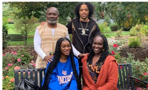
Figure 8: Lincoln University students and staff who participated in the Lions in Ghana virtual program.

Through its IDEAS grant, Lincoln University, a historically Black university, created a faculty-led, short-term hybrid study abroad program in Ghana, a less common study abroad destination. The grant also funded a new study abroad position focusing on study abroad advising, outreach, and application management. As a result of the IDEAS grant, Lincoln University students participated in a virtual exchange, Lions in Ghana, with partners in Ghana in the summer of 2021. This program equipped students with the skills, knowledge, and experience to thrive in a globally connected world through education abroad.