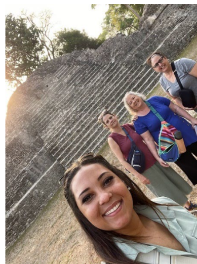
Figure 11: MSUB student and faculty in Belize.

With its IDEAS grant, Montana State University Billings (MSUB) increased student participation in international education opportunities through the creation of an easily replicable model for study abroad. Specifically, the institution created a new model of faculty-led, short-term programming with full credit general education courses. IDEAS grant funding supported four faculty members’ participation in exploratory trips focused on programs promoting the study of natural resources, human rights, women’s empowerment, public health, and migration concerns in Belize, Italy, North Macedonia, and Peru. As a result of the IDEAS grant, 14 students in total participated in the new programs. This new model of study abroad programming for the university will be replicated for students in the years to come.