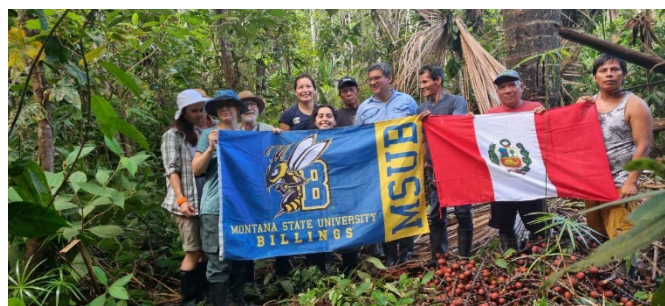
Figure 12: MSUB students and faculty in Peru.

Grant Period: August 1, 2020 – September 30, 2022