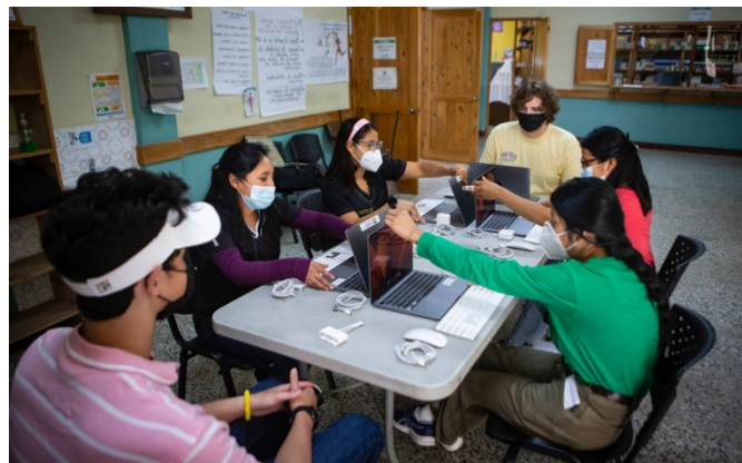
Figure 1: BWU students training Mission Guatemala staff on how to utilize the medical records software.