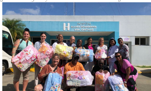
Figure 5: CCBC faculty in the Dominican Republic visiting a health center.