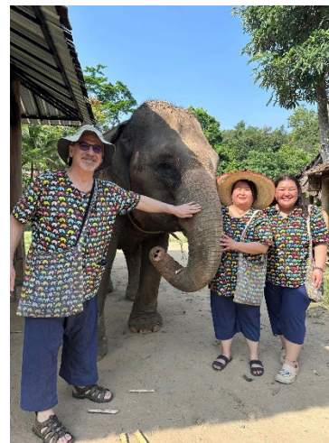
Figure 18: UW-Stout faculty site visit in Thailand.

With its IDEAS grant, the University of Wisconsin-Stout (UW-Stout) successfully launched a new faculty-led study abroad program series in Thailand and Costa Rica, both less common study abroad destinations. The programming focused on the cultural histories of these countries, designed to engage undergraduate students in multiple disciplines and backgrounds, including Hmong and Hispanic students who are underrepresented in study abroad. Grant funding supported site visits and marketing and outreach designed to raise student and faculty awareness about the importance of intercultural engagement. Through the IDEAS grant, UW-Stout increased awareness on campus of the importance and benefits of studying abroad and developed a successful programming model that could be applied to different country contexts in the future. Receiving the IDEAS grant served as a catalyst for support on UW-Stout’s campus and allowed access to more than $73,000 in additional donor funding to