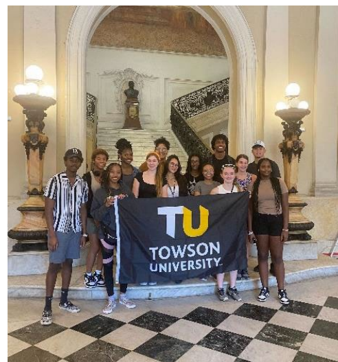
Figure 14: Towson students in Brazil.

To expand its study abroad portfolio and increase access to study abroad, Towson University used its IDEAS grant funding to create and deliver a 12-day experiential faculty-led study abroad program in Rio de Janeiro and Salvador, Brazil, targeting underrepresented and low-income incoming first-year and transfer students. IDEAS grant funding was used to support syllabus development, recruitment activities, and faculty travel costs for the study abroad program. The inaugural program ran successfully in summer 2023 with 12 incoming first-year students and focused on issues of democracy, human rights, infrastructure, and public health. Following their arrival on campus for their first semester in fall 2023, students remained actively engaged with international opportunities and events at the university. The experience in Brazil is highlighted in this Towson study abroad promotional video .