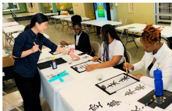
Figure 10: MVSU students learning about Japanese culture during a Travel Tuesdays event.

Through its IDEAS grant, Mississippi Valley State University (MVSU), a historically Black university, strengthened study abroad initiatives and increased institutional support for study abroad by engaging students, faculty, staff, and administrators through a broad series of activities. For students, MVSU used IDEAS grant funding to develop and implement a year-round marketing campaign including virtual and