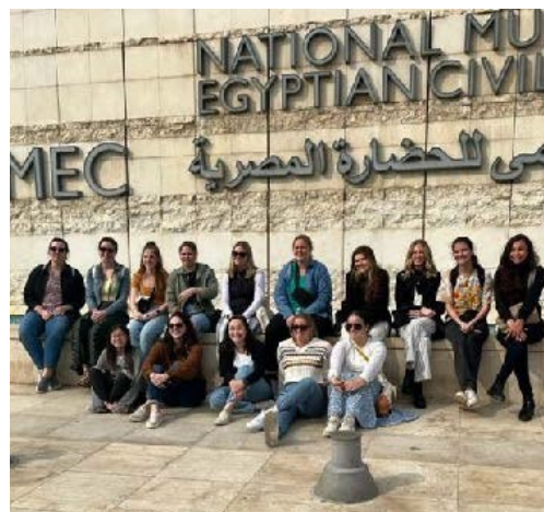
Figure 20: Utica faculty and students in Egypt.

While three faculty members participated on the Ecuador trip without students, the Egypt team of three faculty members were joined by students who provided valuable perspectives and post-visit assessments that will continue to guide the development of the study abroad course. As a result of the IDEAS grant, Utica College ultimately developed new international health sciences curricula, established a foundation for health sciences study abroad programming, and learned valuable lessons and strategies for creating faculty-led programs in the future.