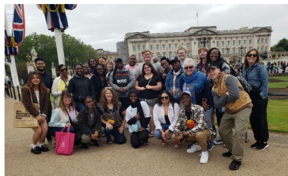
Figure 4: CCBC faculty and students in the United Kingdom.

With its IDEAS grant, the Community College of Baltimore County (CCBC) successfully developed two new faculty-led study abroad programs to the United Kingdom and the Dominican Republic and delivered targeted study abroad faculty leader trainings to over 90 faculty and staff. The two new study abroad programs, created by a consortium consisting of six partner community colleges in Maryland, were designed to expand study abroad access for students who are underrepresented in study abroad including racial/ethnic minority and rural community college students from Maryland in occupational fields of study, with a particular focus on public health and entrepreneurship. In May 2023, 21 students, three faculty leaders funded by the IDEAS grant, and two trainee faculty leaders traveled to Swansea University in Wales. To expand programming in the African Diaspora, grant funding also supported eight faculty members’ travel to the Dominican Republic on an exploratory site visit in August 2023. In addition, a total of 48 faculty and staff