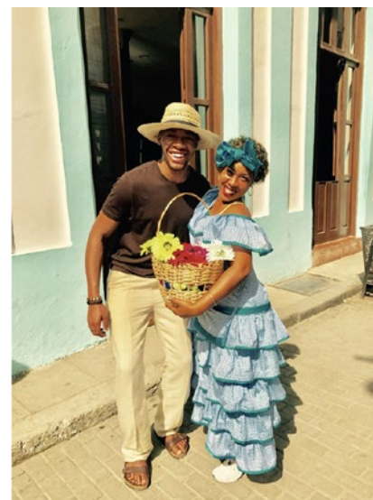
Figure 6: An GSU student mentor participating in a study abroad program.

Georgia State University's (GSU) IDEAS grant focused on increasing study abroad participation among student groups that study abroad in lower numbers on its campus in order to foster greater equity in students' post-graduation pursuits through international education. To achieve this goal, GSU conducted systematic outreach utilizing existing and new campus structures, partnerships, and networks that support these students. Specifically, GSU trained faculty and student peer advisors from a variety of backgrounds to engage with more students on campus and share the feasibility and relevance of study abroad. Grant funding also helped the university establish a new advisor position in the study abroad office to focus on student outreach. Ultimately, GSU reached approximately 200 students and 17 faculty members on campus through its IDEAS grant-funded activities. This expanded outreach has increased the number of prospective study abroad participants and faculty study abroad program leaders, thereby expanding opportunities for students to gain critical career skills through international education.