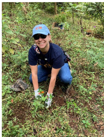
Figure 19: UW-Stout student in Costa Rica.

support students in these programs. “These funds would not have been possible without our 2019 IDEAS [grant] and the matching of institutional priorities toward expanding participation of underrepresented students in study abroad programming,” wrote Scott Pierson.