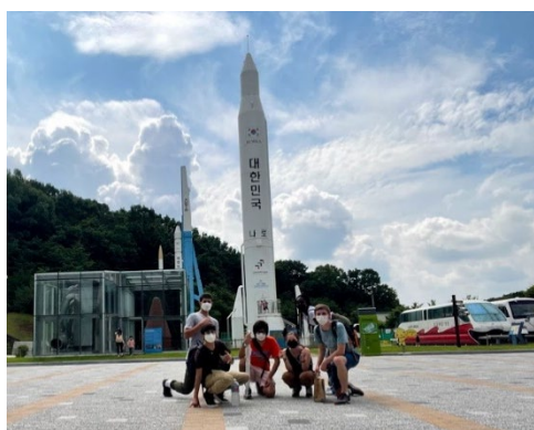
Figure 17: Faculty site visit in South Korea.

Through its IDEAS grant, the University of Florida developed a new faculty-led study-abroad program to South Korea, a less common study abroad destination, to expand study abroad participation among community college students studying science, technology, engineering, and mathematics. This seven-week immersive summer program was developed for