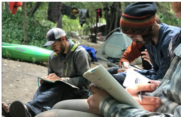
Figure 3: Colorado Mountain College faculty and students in Chile.

“As the manager of the grant, I learned a tremendous amount. I feel fortunate as well as slightly overwhelmed with the knowledge of what it takes to run a successful study abroad program...Perhaps one of the biggest learning moments occurred while we were traveling in Chile. Through our discussion I learned just how similar our communities are even though we are literally on the other side of the world. Additionally, learning how our students have the same hopes and aspirations has only fueled my desire to connect them to other cultures and experiences. We all struggle to find funding to