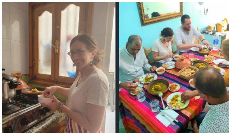
Figure 9: Massasoit faculty on their exploratory trip to Morocco.

Grant Period: August 1, 2020 – March 30, 2023