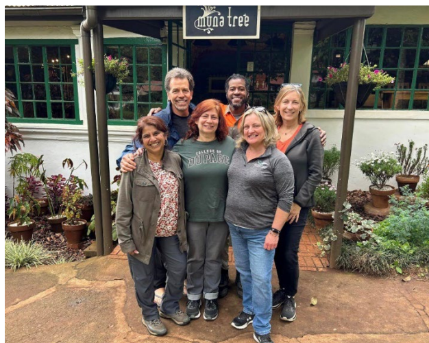
Figure 2: College of DuPage faculty and staff at Brackenhurst Conference and Retreat Center in Limuru, Kenya.

Grant Period: August 1, 2020 – September 30, 2023