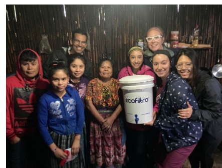
Figure 13: TWU students and faculty in Guatemala.

Through its IDEAS grant, Texas Woman’s University (TWU) developed a bilingual, medical immersion study abroad program to Guatemala targeting nursing and health science students, who are underrepresented in study abroad. IDEAS grant funds were used to develop the bilingual healthcare curriculum, conduct partner outreach, and recruit and train faculty and students. As a result of the grant, TWU conducted a 10-day medical immersion experience in Guatemala, a less-common study abroad destination, for 13 health science and dental health students focused on themes of public health and women’s empowerment. The program helped to fulfill a local community need for bilingual healthcare workers.